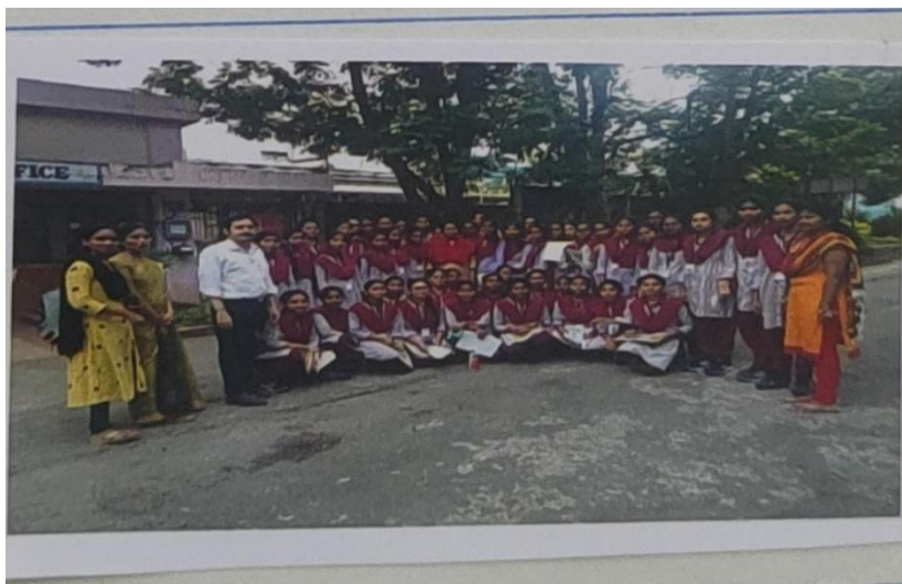
STUDENTS VISIT ITC BADRACHALAM

And other important accounts keeping and cost other related information has been given by the staff of different department of the company.