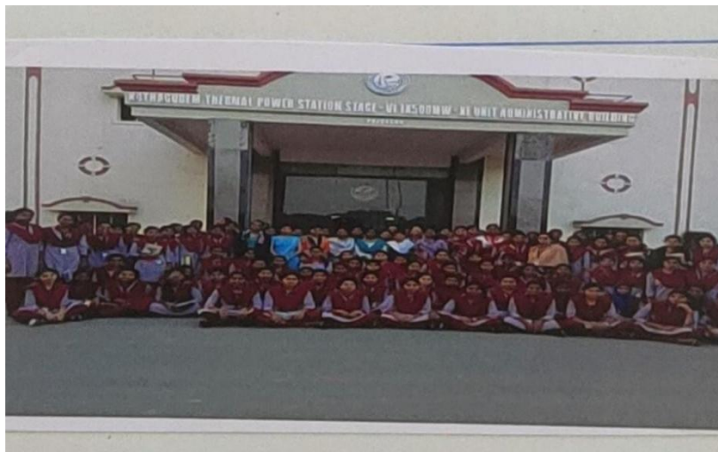
STUDENTS AT KTPS PALONCH