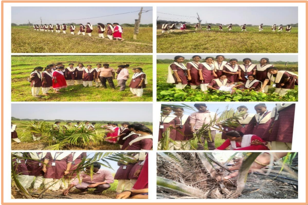
FIELD TRIP –PALM OIL CROP