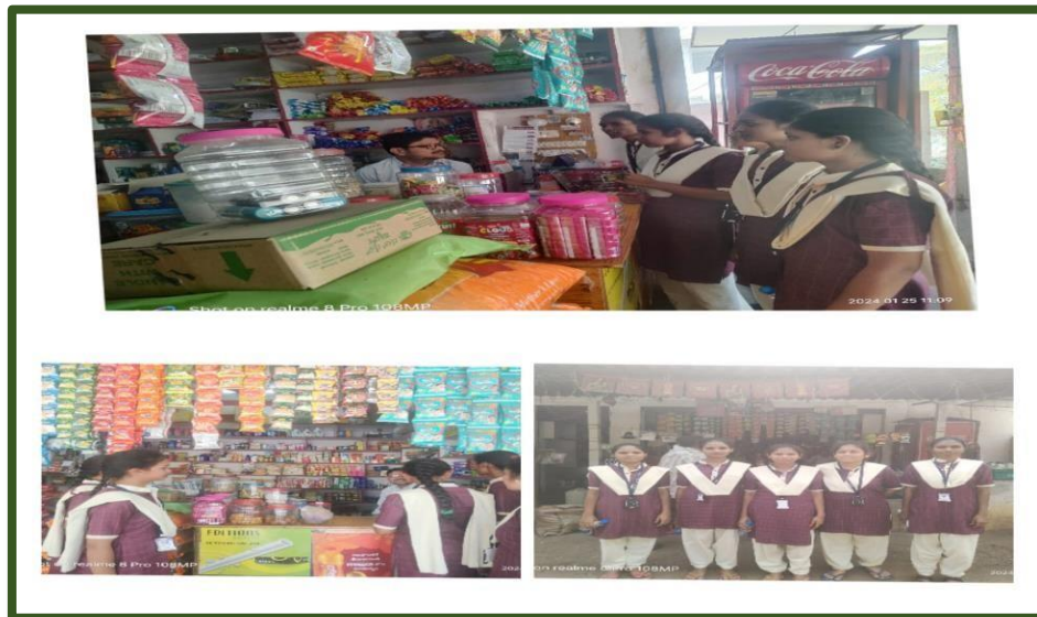
STUDENTS ARE VISITED GENERAL STORE