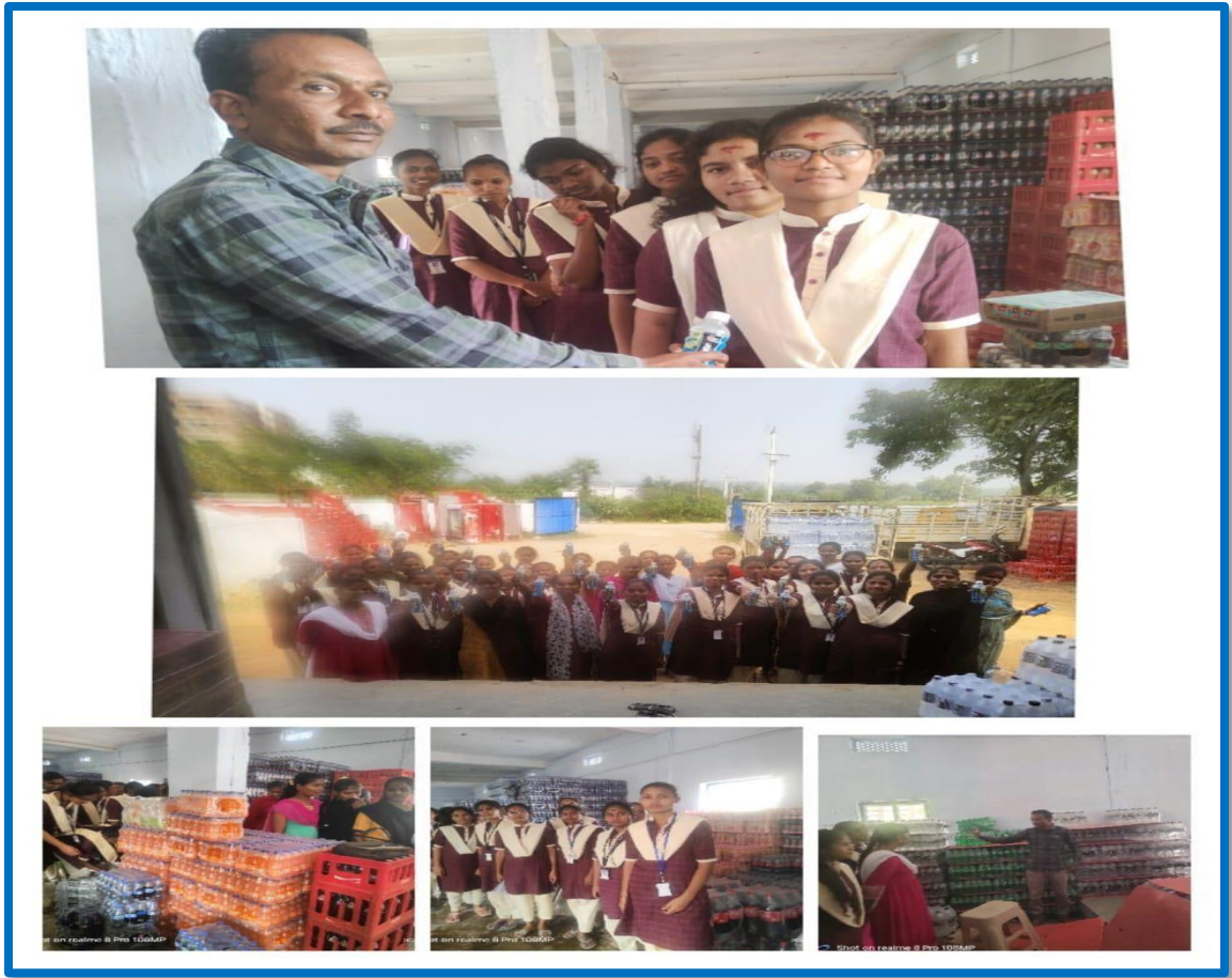
STUDENTS VISITED COCO-COLA GODOWN