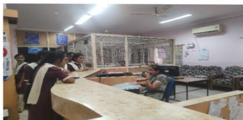
STUDENTS VISITED IOB AND ATM