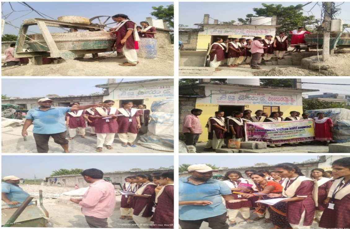
Students are Interacted to the Workers