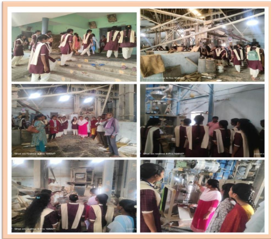
STUDENTS VISITED TOOR DALL MILL