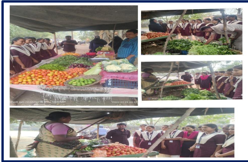
STUDENTS ARE VISITED VEGETABLE MARKETS